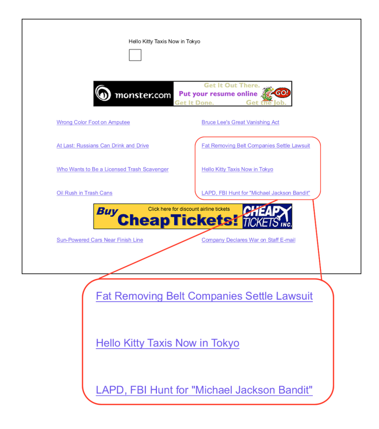
Fig. 4. Screen layout for a literal precue trial with a zoomed-out view of three headlines. The precue at the top disappeared when the layout appeared.

After the visual search tasks, participants were given a short break and then asked to view and identify banners that were shown in the study. This was the first mention of the banners to the participants. It was explained that they would see some banners that had been in the study and others that had not. The banners were displayed on the screen one at a time, and participants responded by clicking a "yes" or "no" button at the bottom of the screen. Each click triggered the presentation of the next banner. A total of 60 banners were presented (30 animated and 30 static). Of these, 40 banners had appeared during the visual search tasks and 20 had not. Participants were not given feedback on accuracy for this memory task and speed was not recorded or emphasized.